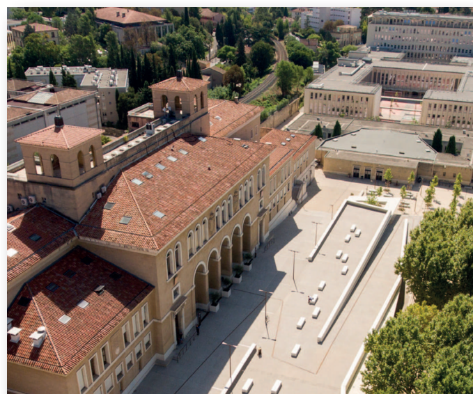
Europe-Asia Research Institute